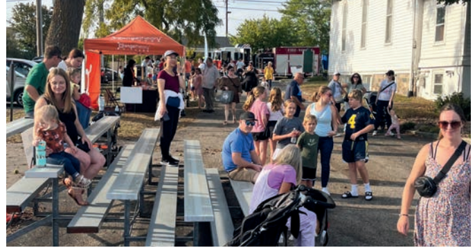
▲ Neighbors came together for a day of community and celebration at the fifth annual Cascade Heritage Festival.

To ensure that future development in Cascade aligns with residents’ long-term growth goals, Township leadership and staff continue to review and update a new draft zoning ordinance. The Board of Trustee’s deliberations on this initiative have included some robust public discourse and opportunities for transparent conversations about public issues that impact every property owner and resident in Cascade. I believe this civil discourse, although tense at times, is a natural and critical component of effective and representative governance. I am also confident it allows for the community-wide engagement critical to ensuring that the Board’s goals are aligned with those of our residents.