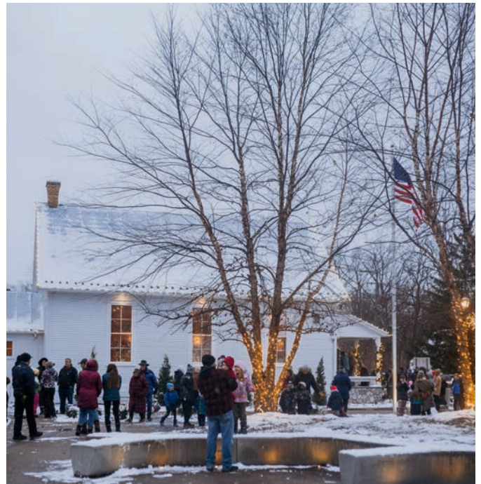
▲ Let’s kick off the holidays together at the annual Cascade Tree Lighting Ceremony. See the back page for event details.

May the upcoming holidays be extra special for you and your families this year. As always, please share any thoughts, concerns or suggestions you may have. It is an honor to serve as your Supervisor.