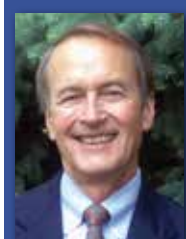
FROM THE SUPERVISOR