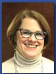
FROM THE CLERK