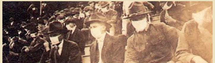
College football game, circa 1918

The point of this is that what is happening now is a major historic event. As such, we would like to assemble information about the current situation and how it affects Cascade residents. We hope to assemble a cache of stories, accounts and photographs so future generations have a more detailed account of these life-changing events.