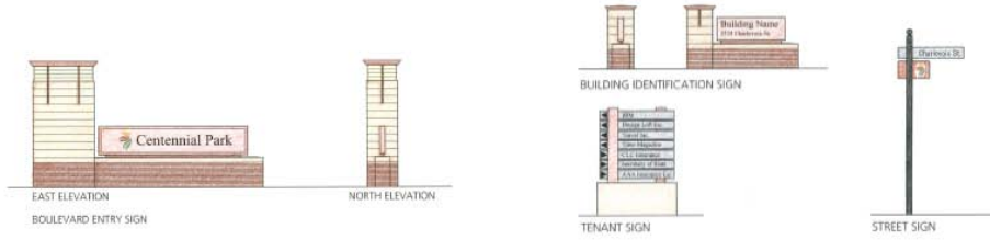
EAST ELEVATION BOLIVARD ENTRY SIGN