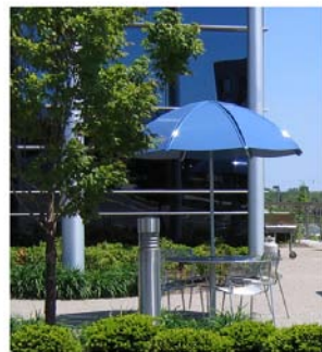
BOLLARD LIGHT TABLE AND CHAIRS