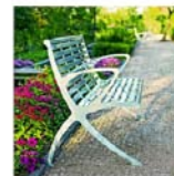
BENCH WITH BACK