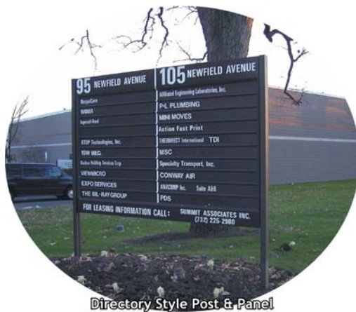
Directory Style Post & Panel