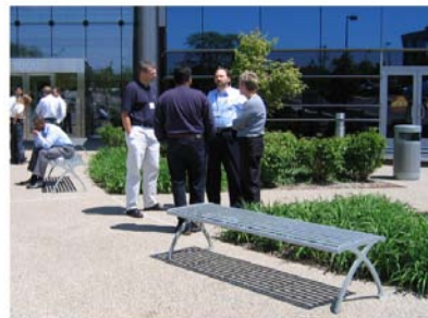
BACKLESS BENCH BOLLARD WASTE RECEPTACLE